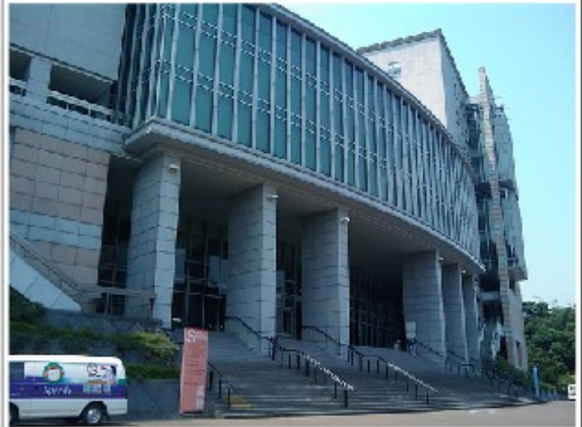
The entrance of the venue - Research Center for Humanities and Social Sciences, Academia Sinica.