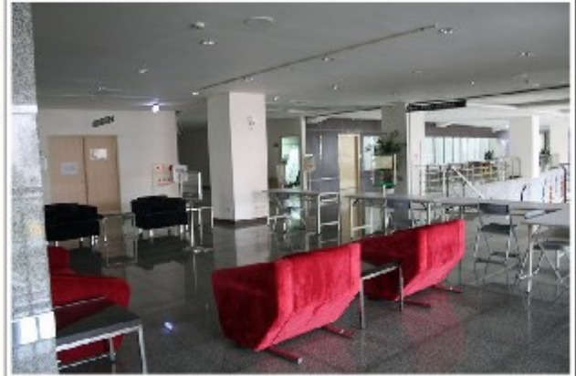
The hallway view #2