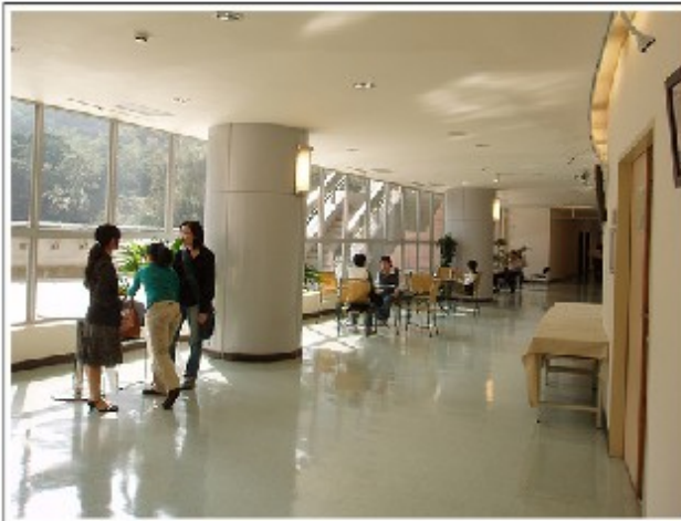
The hallway view #1