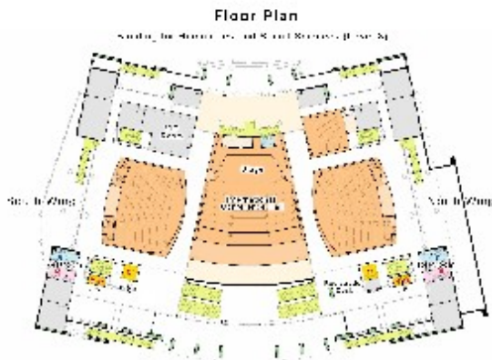
The floor plan of the 3 rd floor of the building. At the center is the International Conference Hall that spans to the 4 th floor as well. The conference hall at left and right are mirror images of each other.