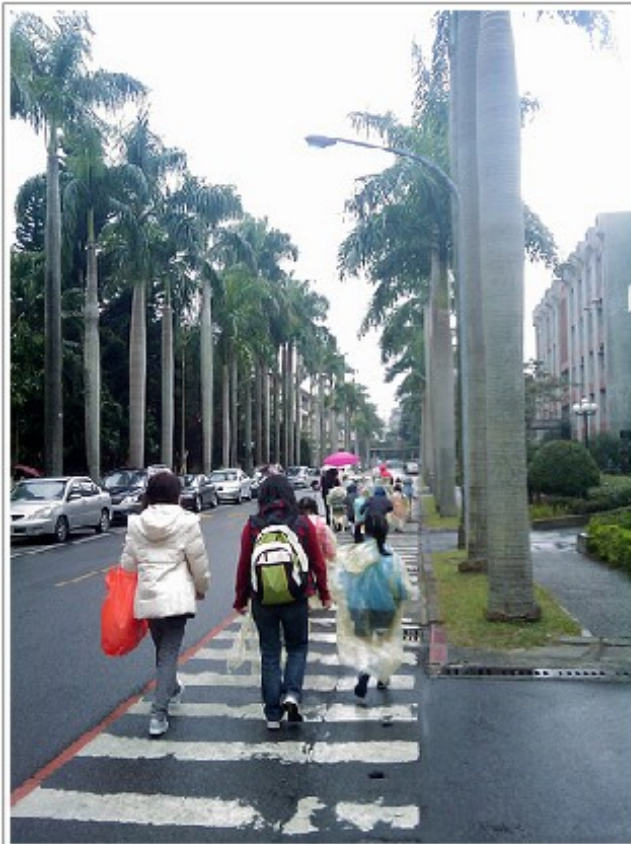
The campus of Academia Sinica

There are 4 conference rooms in this building, see the following floor plan for details. The main room is the "International Conference Hall" which spans the 3 rd and 4 th floor providing 426 seats. Rooms #2 and #3 are located on the 3 rd floor and mirror each other providing 117 seats each. Room #4 is located on the 4 th floor providing approximately 200 seats.