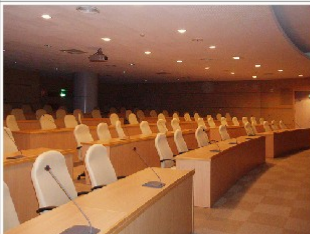
Conference room #2 and #3 are mirror image of each other, capacity = 117