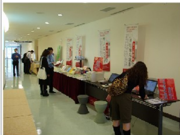
Booth space in the hallway