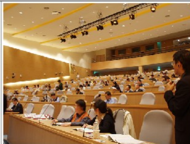
The main conference hall, capacity = 311 + 115 in the balcony