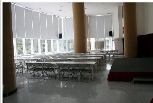
The conference room #4.