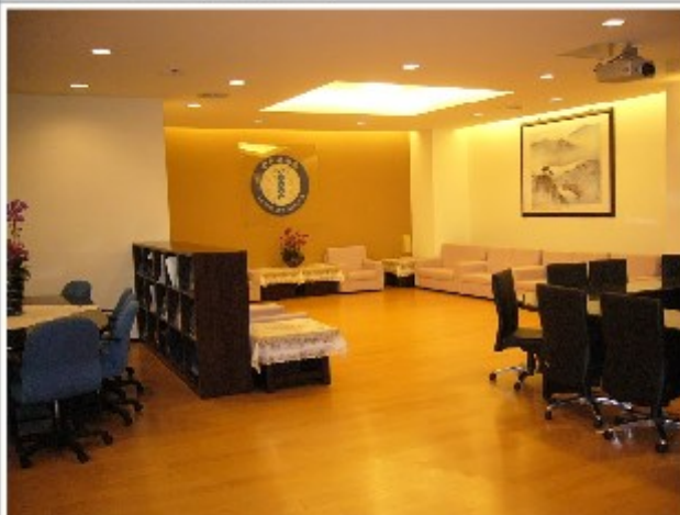
VIP room, can be used for press or by speakers